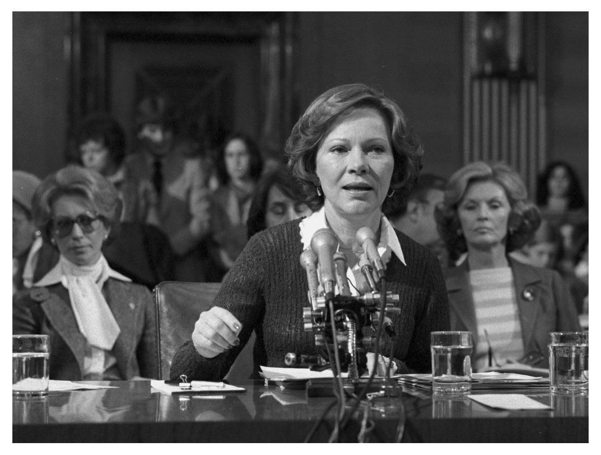
Testifying Before Congress on Mental Health, February 7, 1979

"I want people to know what I know—that today because of research and our knowledge of the brain, mental illnesses can be diagnosed and treated effectively, and the majority of those with these conditions can recover and lead fulfilling lives...going to school, working, raising a family, and being productive citizens in their communities."