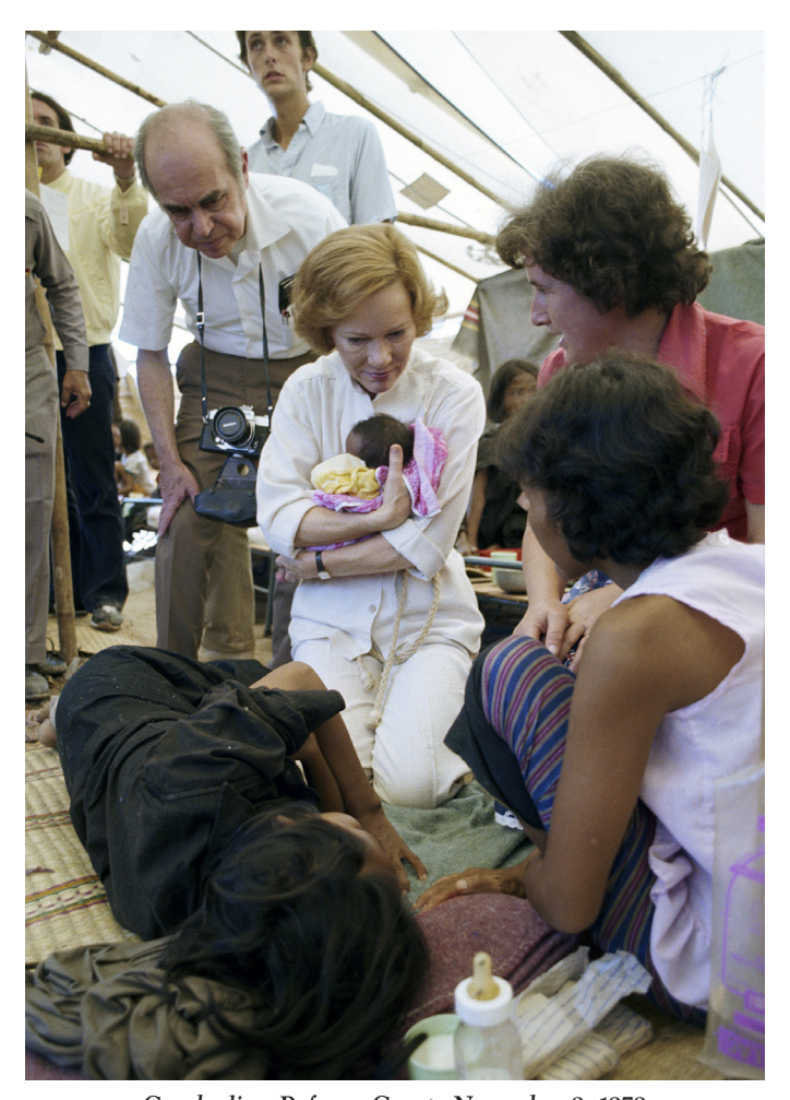
Cambodian Refugee Camp, November 9, 1979