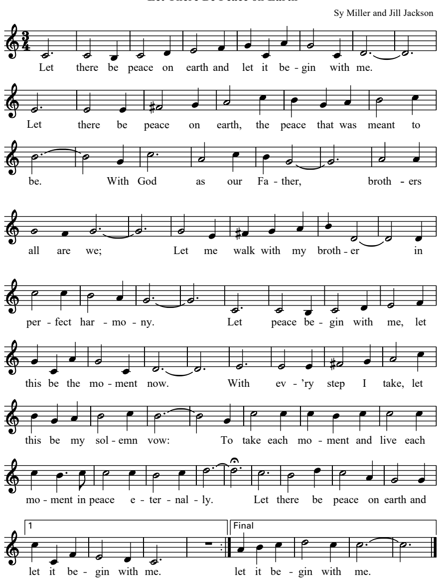
Copyright © 1955, renewed 1983 by Jan-Lee Music (ASCAP). All rights reserved. Reprinted with permission. International copyright secured.